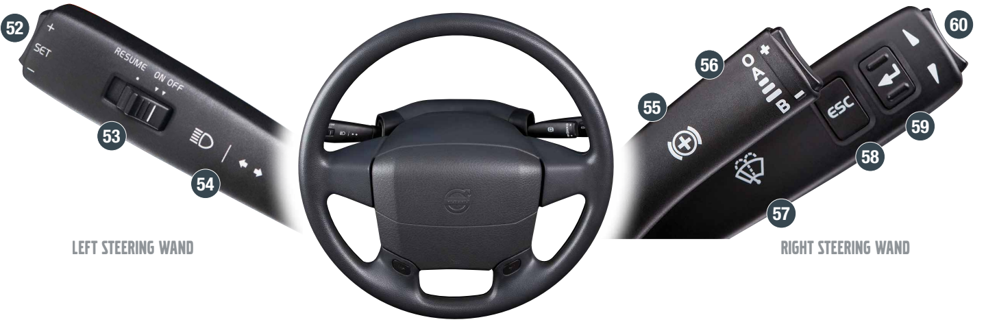
LEFT STEERING WAND